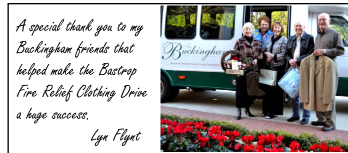
A special thank you to my Buckingham friends that helped make the Bastrop Fire Relief Clothing Drive a huge success.

Sunday Worship Depart - 10:30 a.m. - Lobby Sunday Brunch - 11:00 - 2:00 p.m. - WDR Chapelwood Worship - 11:10 a.m. - T Worship Service- 3:15 p.m. - Plaza, 1DR Neighborhood Chat - 4:00 p.m. - Mezz Movie Matinee - 5:00 p.m. - T